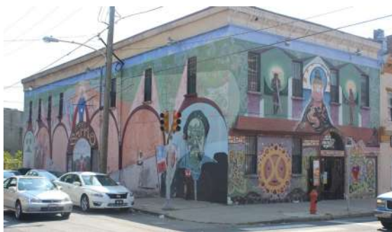
At the corner of Huntingdon and 5th Street, we will have three classrooms, a prayer and reflection space, and a large activity room.