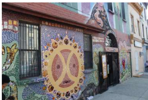
While the building will be painted, we will keep the mosaic mural in front, created by neighborhood children.

This will be a home for Providence Center and our students, a place imbued with the Holy Child spirit. Join us in celebrating this important next step. Join us in celebrating hope! ♦